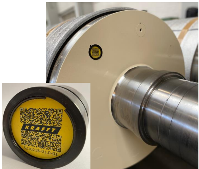
The KRAFFT Walzen CARLexa Tag (2021)

Via CARLexa, we provide data stored on a tag (QR and / or RFID) that can be read without an internet connection.