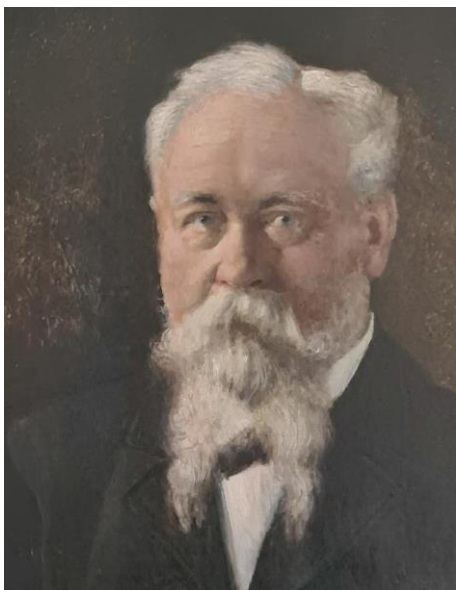
Our Founder (1837- 1922)